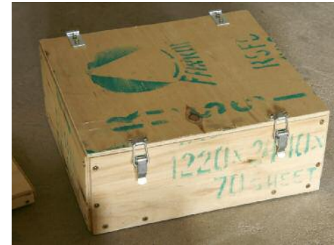
box #4 "Petite histoire" (little story) - 2008 34.5 x 33.5 x 15 cm

a text collage, two photographs, a video player, two speakers