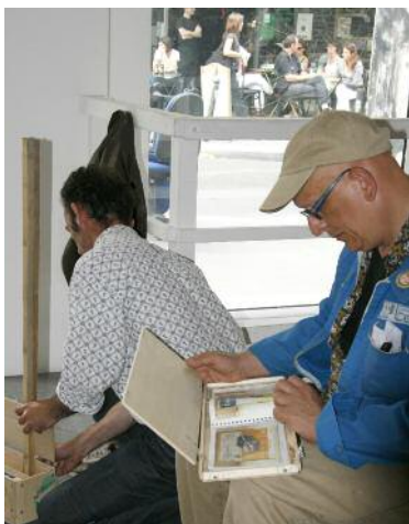
box #3 "collection de réalités" (Collection of realities)