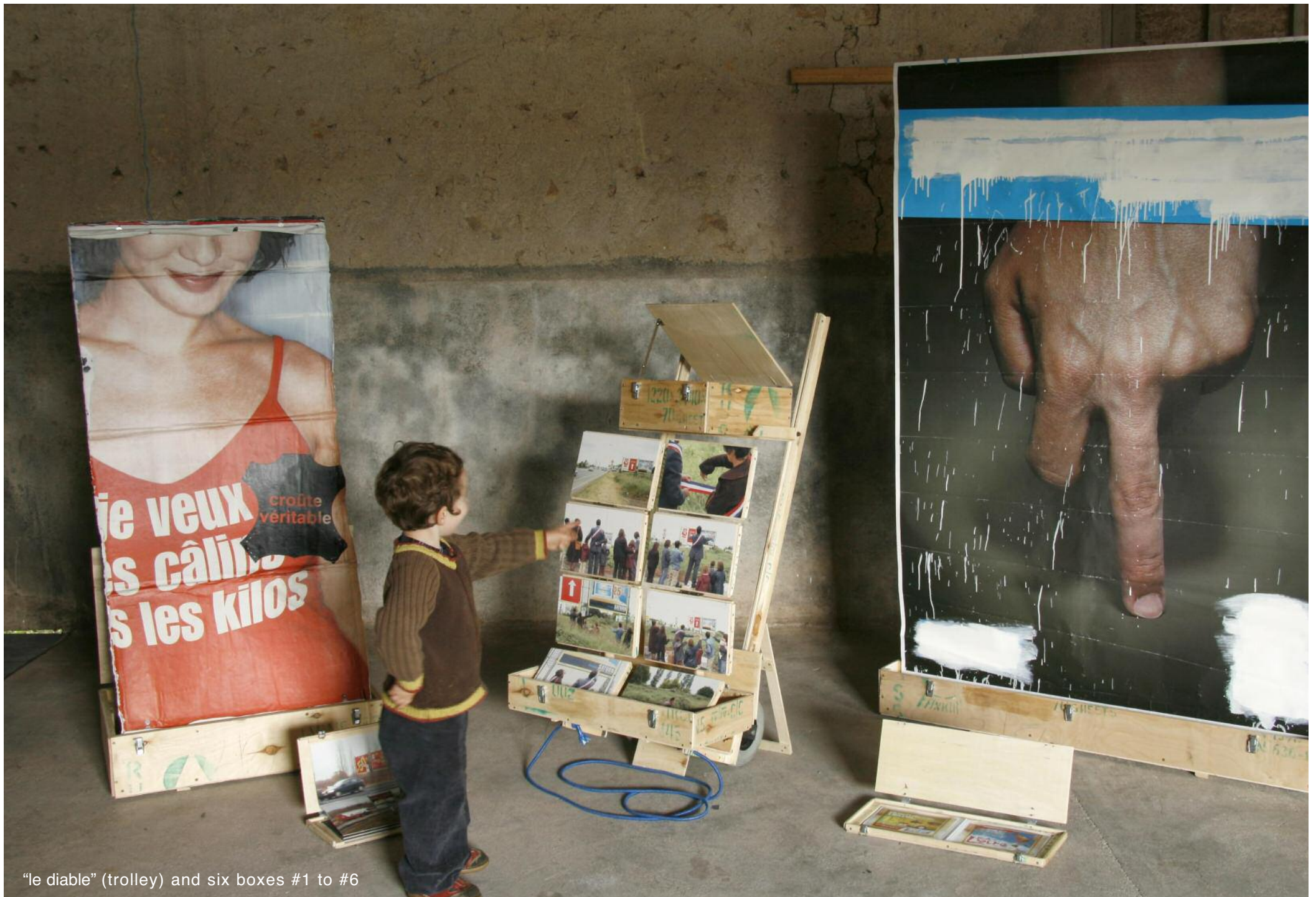
"le diable" (trolley) and six boxes #1 to #6