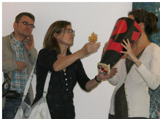
box #12 "pavillon" (pavilion)