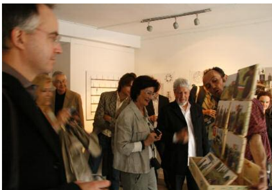
box #2 "monsieur le maire" (Your Worship the Mayor)