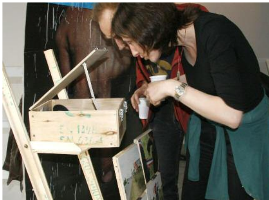
box #4 "Petite histoire" (little story)