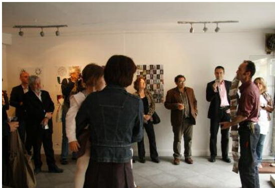
box #1 "expo continue" (permanent exhibition)