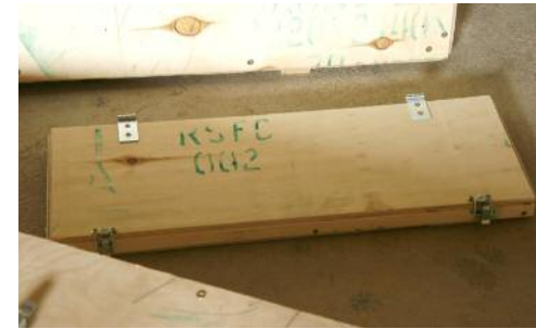
box #3 "collection de réalités" (Collection of realities) - 2007 48.5 x 20.5 x 3.5 cm

booklet with fifty six photographs 19 x 12.5 cm