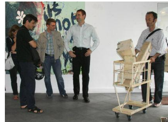
caddie de la collectionneuse de moins de cinquante ans (the trolley of the under fifty female collector)