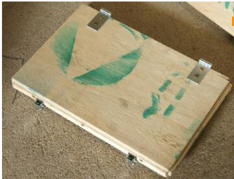
box #1 "expo continue" (permanent exhibition) - 2006 27.5 x 20 x 3.5 cm

folding album with ten photographs 21 x 14.5 cm