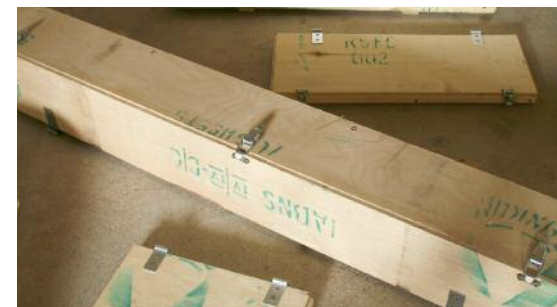
box #6 "sans lire" (without reading) 2007 123 x 15.5 x 16 cm (close)

display unit for a painted advertisement 175 x 120 cm (open)