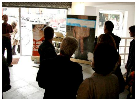
box #5 "morceau choisi" (selected piece) and box #6 "sans lire" (without reading)