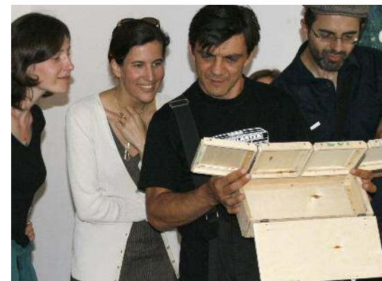
box #11 "vues de campagne" (views of countryside)