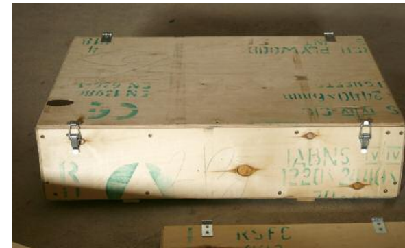
box #5 "morceau choisi" (selected piece) - 2008 4,5 x 33,5 x 15 cm (closed)

display unit for an advertisement croûte 133 x 65 cm (open)