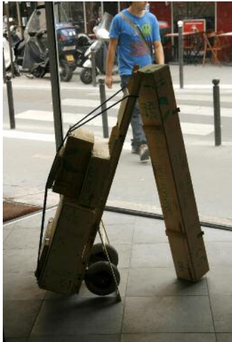
bundle "le diable" (trolley) - 2008 six boxes #1 to #6 on a two-wheeled trolley to open by appointment...