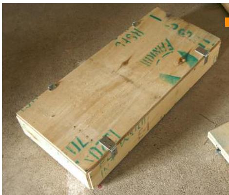
box #2 "monsieur le maire" (Your Worship the Mayor) - 2006 59 x 27.5 x 11 cm

display unit with eight photographs 25.5 x 17.5 cm