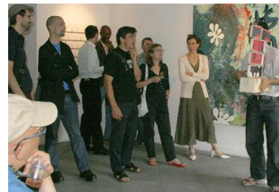
box #8 "morceaux de publicité" (fragments of advertising)